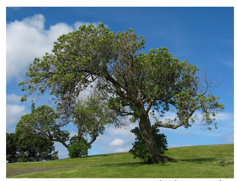
Figure 3.2. Tree on Mount Victoria Devonport, New Zealand.

The example of how to fulfil the above conditions is provided in Figure 3.2. Remember to check for license terms and conditions when using an element covered by a license. If not license is explicitly provided, full copyright applies, therefore, you are not allowed to use a given piece of work without written consent of the author.