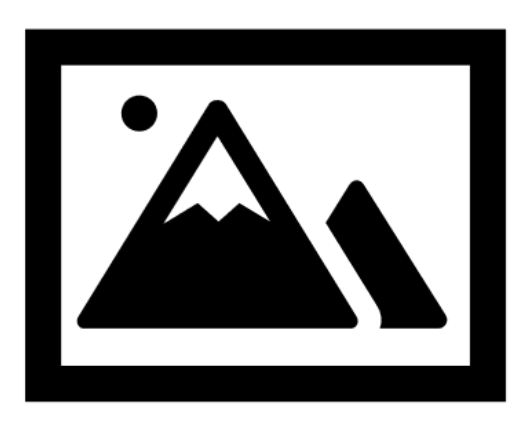
Figure 1: This is an example figure.

Figures should be displayed on a white background. When preparing figures, consider that they can occupy either a single column (half page width) or two columns (full page width), and should be sized accordingly.